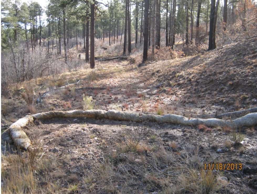
Figure 6 View east on access road into Fishladder Canyon (11/18/2013)