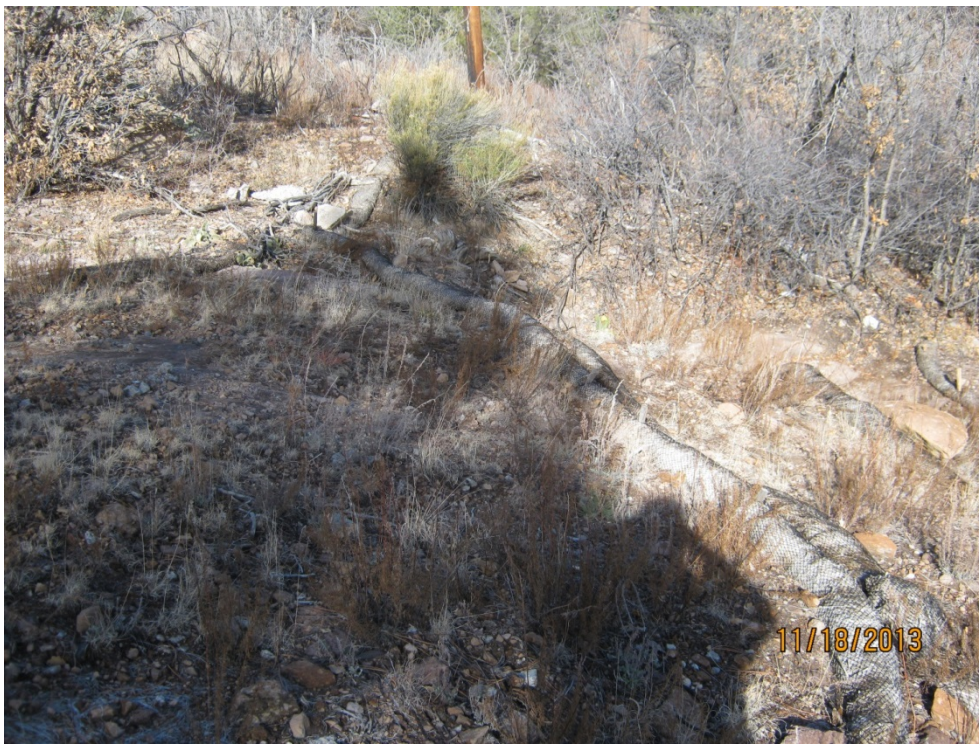
Figure 3 Wattles at the top of drainage into Fishladder Canyon (11/18/2013)