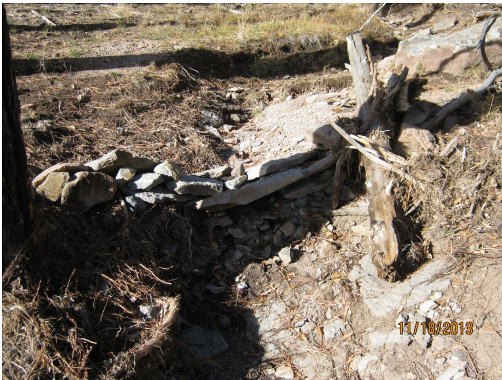
Figure 7 Rock check dam in the bottom of Fishladder Canyon (11/18/2013)