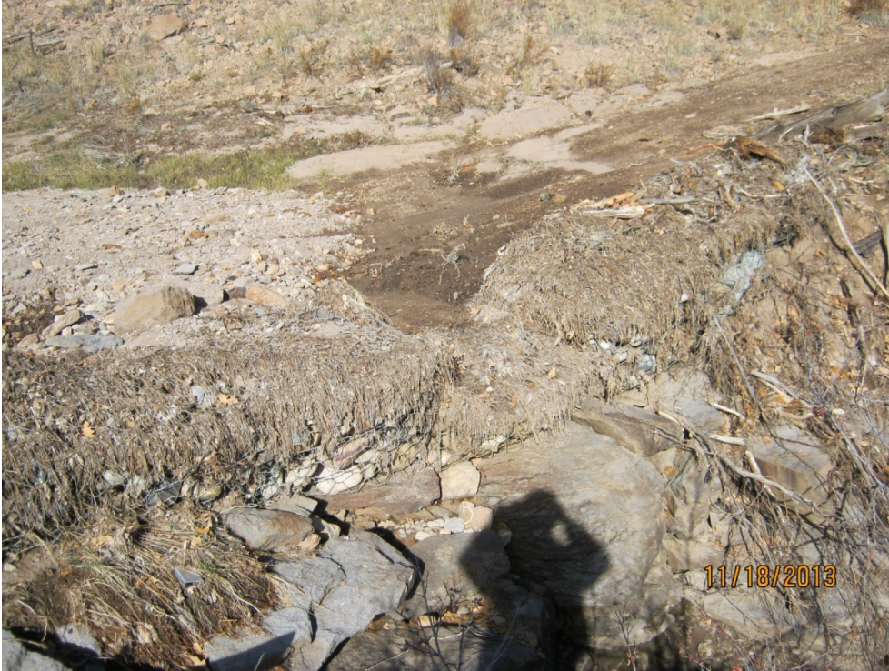
Figure 8 Gabions at the crossing of the access road in Fishladder Canyon (11/18/2013)