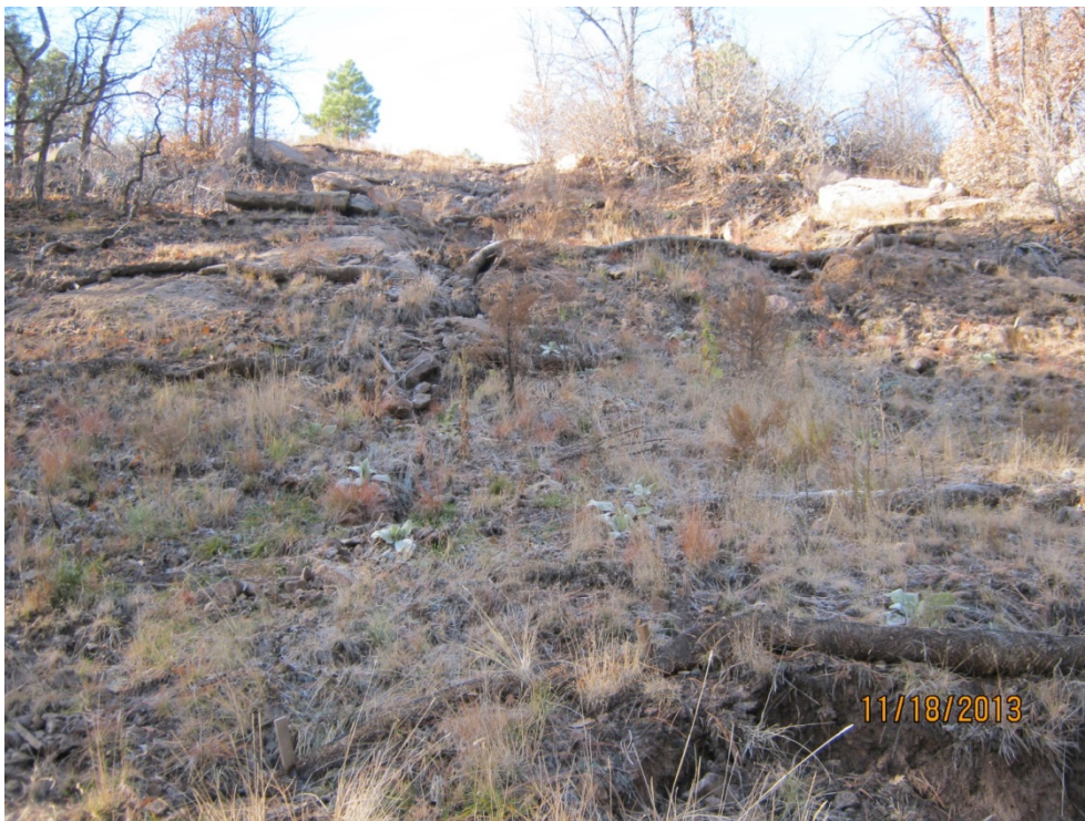
Figure 5 View looking upslope out of Fishladder Canyon (11/18/2013)