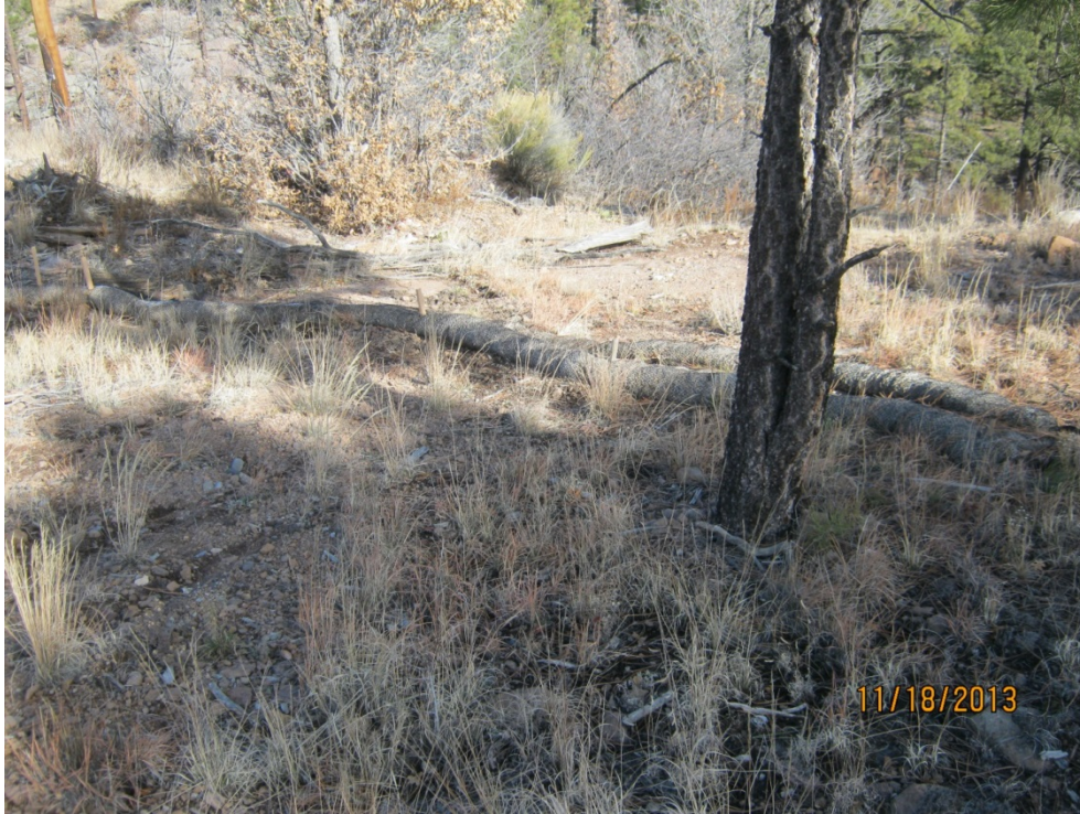
Figure 2 Wattles at the top of drainage into Fishladder Canyon (11/18/2013)