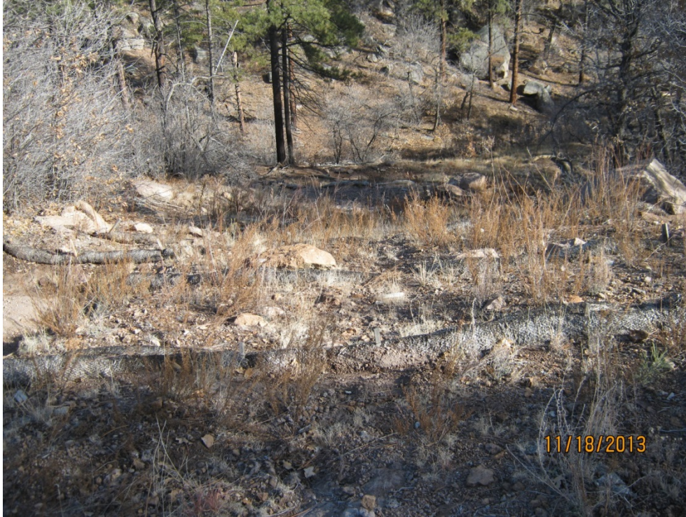
Figure 4 View looking downslope from mesa top into Fishladder Canyon (11/18/2013)